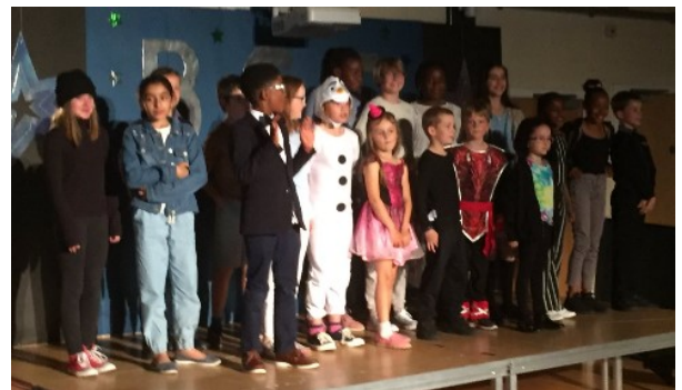
All of our fantastic performers! What a show!